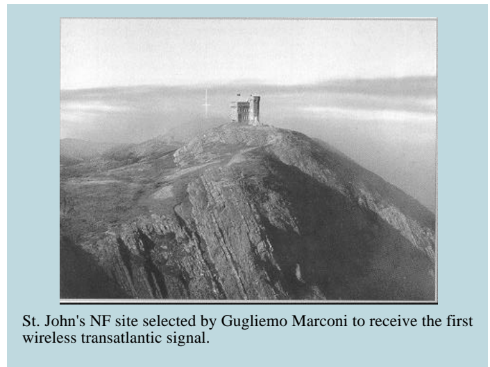
St. John's NF site selected by Guglielmo Marconi to receive the first wireless transatlantic signal.

Well I am going to stop there, The story of the advances in the communications industry since the start of the 20th century is well documented. From radio to television, from wired to wireless, from copper to fiber optics, from earth to satellites and beyond, the progress has been outstanding and worthy of your research. There are lots of "Atlantic Oceans" out there to be challenged and I urge you to tackle them by following Churchill's advice, "to look back occasionally so that you can see further into the future."